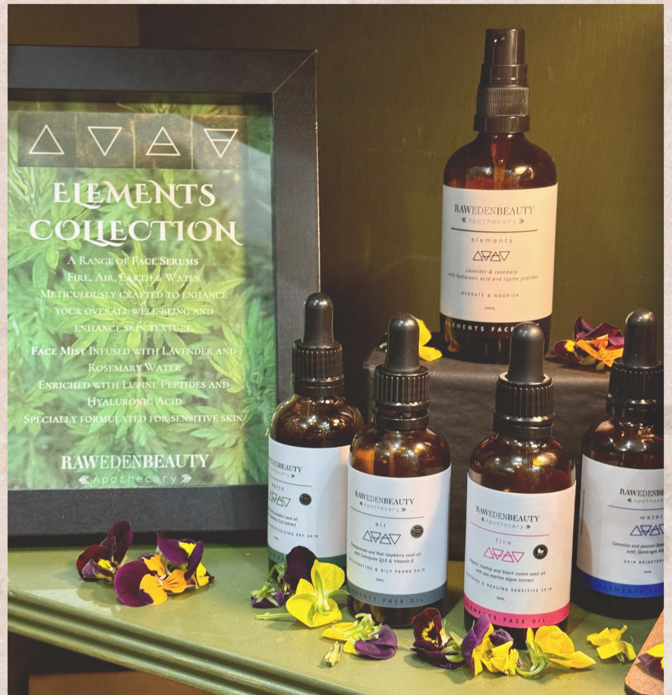
Serums £18 per 50ml and Face mist £19 per 100ml

Cheers to mum and dad for their help and ninja cleaning moves!